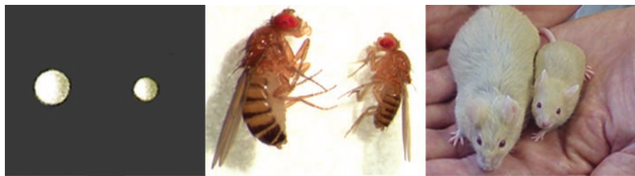
Fig. 1. Wild-type (left specimen) and long-lived dwarf (right specimen) yeast, flies, and mice with mutations that decrease glucose or insulin/IGF-I-like signaling. Yeast sch9 null mutants form smaller colonies (left). sch9 mutants are also smaller in size, grow at a slower rate, and survive three times longer than wild-type yeast. chico homozygous mutant female flies are dwarfs and exhibit an increase in life-span of up to 50% (center) (21). Chico functions in the fly insulin/IGF-I-like signaling pathway. The GHR/BP mice are dwarfs deficient in IGF-I and exhibit a 50% increase in life-span (right). Other yeast and worm mutants exhibit life-span extension of more than 100% but do not have detectable growth defects.

Mammals also exhibit an association between stress resistance and reduced IGF-I signaling. The activities of antioxidant enzymes such as superoxide dismutases and catalase are decreased in murine hepatocytes exposed to GH or IGF-I and in transgenic mice overex-